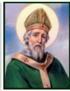
Saint Patrick Church

416 Custom House Street, Frederiksted, St. Croix, USVI 00840 Telephone: 340 (340) 772-0138; Fax (340) 772-0142 Website: www.saintpatrickusvi.org Email: saintpatrickusvi@gmail.com