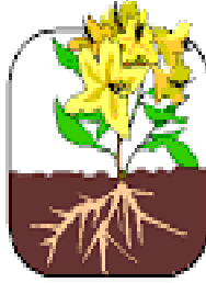
The Good Soil