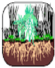
The Weedy Soil