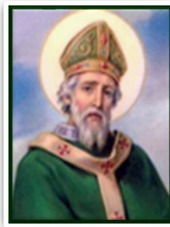
Saint Patrick Church

416 Custom House Street, Frederiksted, St. Croix, USVI 00840 Telephone: 340 (340) 772-0138; Parish Priest: 340-514-3050 Website: www.saintpatrickusvi.org Email: saintpatrickusvi@gmail.com