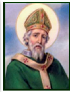
Saint Patrick Church

416 Custom House Street, Frederiksted, St. Croix, USVI 00840 Telephone: 340 (340) 772-0138; Parish Priest: 340-514-3050 Website: www.saintpatrickusvi.org Email: saintpatrickusvi@gmail.com