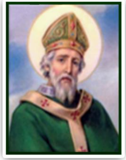
Saint Patrick Church

416 Custom House Street, Frederiksted, St. Croix, USVI 00840 Telephone: 340 (340) 772-0138; Fax (340) 772-0142 Website: www.saintpatrickusvi.org Email: saintpatrickusvi@gmail.com