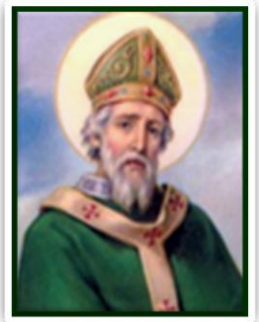
Saint Patrick Church

416 Custom House Street, Frederiksted, St. Croix, USVI 00840 Telephone: 340 (340) 772-0138; Fax (340) 772-0142 Website: www.saintpatrickusvi.org Email: saintpatrickusvi@gmail.com