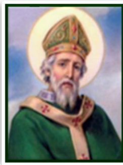
Saint Patrick Church

416 Custom House Street, Frederiksted, St. Croix, USVI 00840 Telephone: 340 (340) 772-0138; Parish Priest: 340-514-3050 Website: www.saintpatrickusvi.org Email: saintpatrickusvi@gmail.com